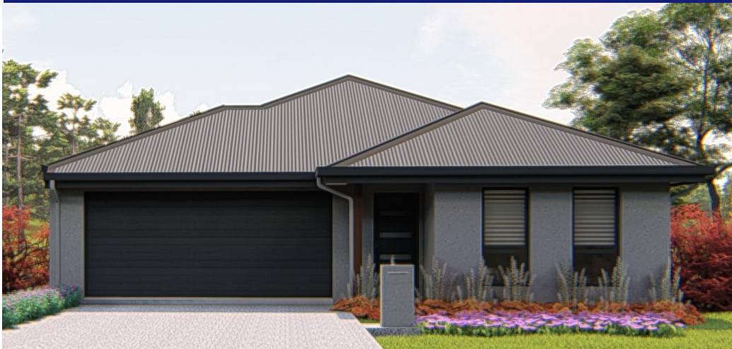
ILLUSTRATED WITH TRADITIONAL FAÇADE

LESS $15,000 F.H.O.S. GRANT TO APPROVED PURCHASERS