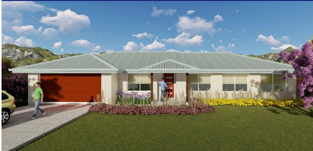
ILLUSTRATED WITH TRADITIONAL FAÇADE

LESS $15,000 F.H.O.S. GRANT TO APPROVED PURCHASERS