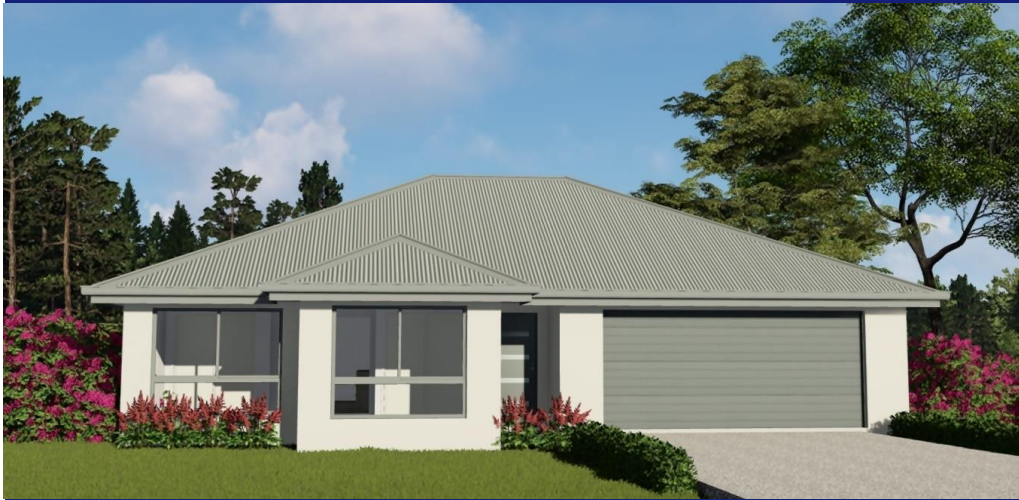
ILLUSTRATED WITH TRADITIONAL FAÇADE

LESS $15,000 F.H.O.S. GRANT TO APPROVED PURCHASERS