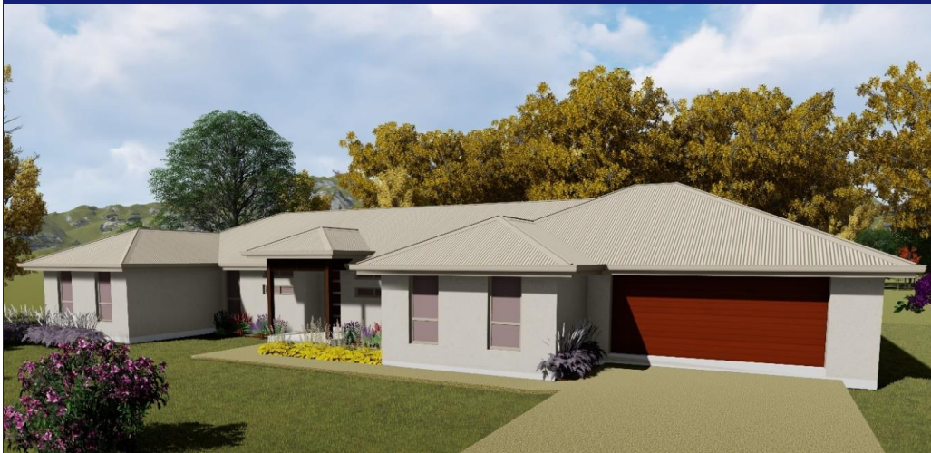
ILLUSTRATED WITH TRADITIONAL FAÇADE AND OPTIONAL RAISED PORCH ROOF