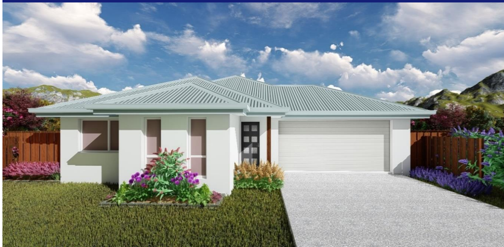
ILLUSTRATED WITH TRADITIONAL FAÇADE

LESS $15,000 F.H.O.S. GRANT TO APPROVED PURCHASERS