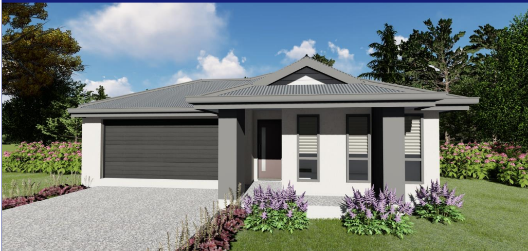
ILLUSTRATED WITH OPTIONAL DUTCH GABLE FAÇADE

LESS $15,000 F.H.O.S. GRANT TO APPROVED PURCHASERS