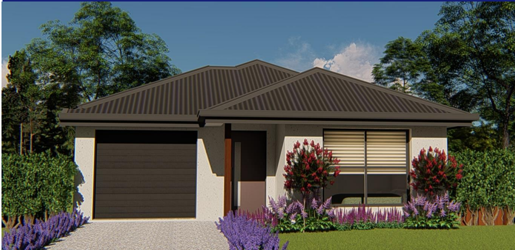
ILLUSTRATED WITH TRADITIONAL FAÇADE

LESS $15,000 F.H.O.S. GRANT TO APPROVED PURCHASERS