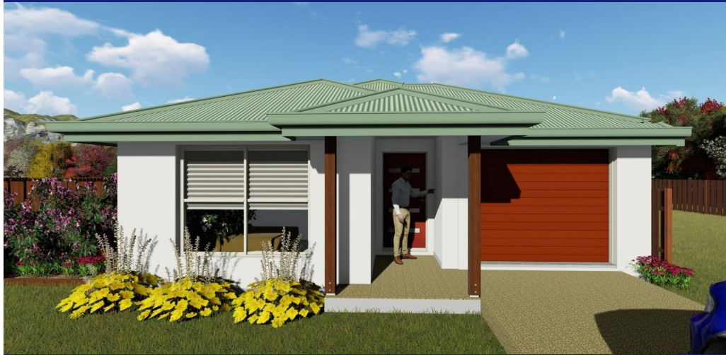
ILLUSTRATED WITH TRADITIONAL FAÇADE

LESS $15,000 F.H.O.S. GRANT TO APPROVED PURCHASERS