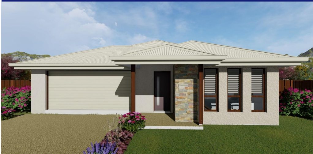
ILLUSTRATED WITH TRADITIONAL FAÇADE AND OPTIONAL STONE FEATURE WALL

LESS $15,000 F.H.O.S. GRANT TO APPROVED PURCHASERS