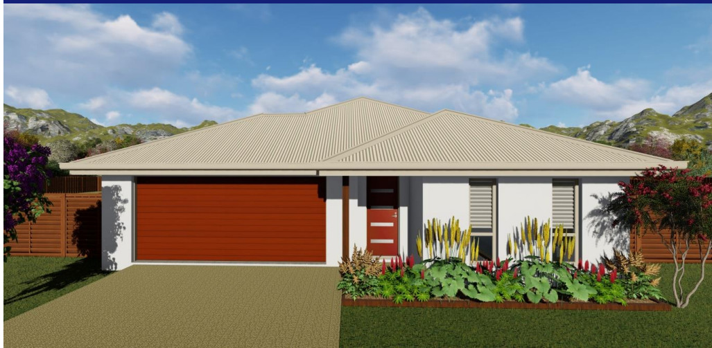
ILLUSTRATED WITH TRADITIONAL FAÇADE