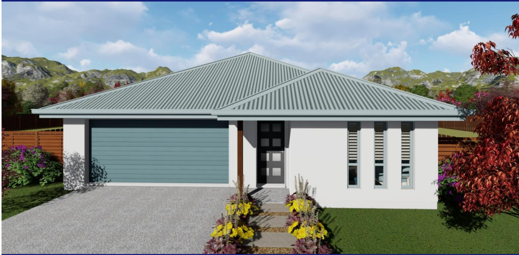
ILLUSTRATED WITH TRADITIONAL FAÇADE